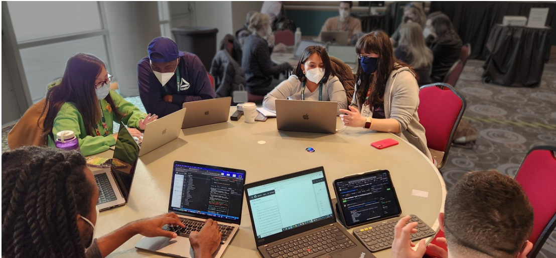
PyCon US 2023 Sprints